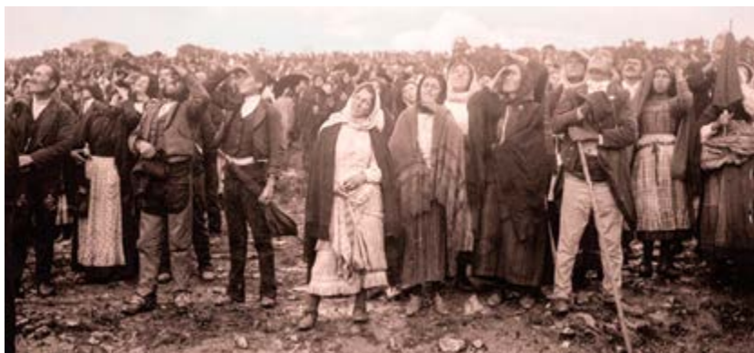
People during the miracle of the sun (October 17, 1917)

Jacinta. Her answer reveals the degree of her spiritual life. She firmly declares that she wrote “solely and exclusively for the glory of Jesus and the Blessed Virgin,” and she continues, “I now take up this work, in spite of the repugnance I feel, since I can say almost nothing about Jacinta without speaking either directly or indirectly about my miserable self. I obey, nevertheless, the will of Your Excellency, which, for me, is the expression of the will of God. I begin this task, then, asking the most holy Hearts of Jesus and Mary to deign to bless it, and to make use of this act of obedience to obtain the conversion of poor sinners, for whom Jacinta so generously sacrificed herself.” She made the same declaration for all the other memoirs and public writings; she never wrote anything of her own initiative, but always and only on the express order of the bishop. She always had an extreme reluctance and repugnance to write, especially when it came to writing down the secrets. When she was ordered to write down the Third Secret, she even fell into a mysterious and dangerous illness.